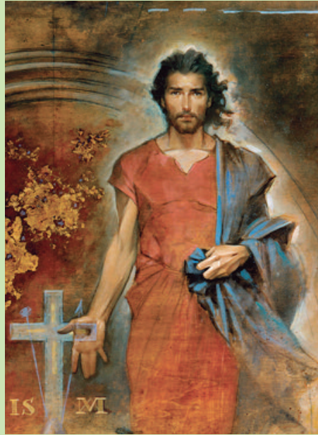
WITNESSES OF THE REDEEMER: