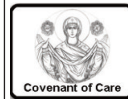
Covenant of Care