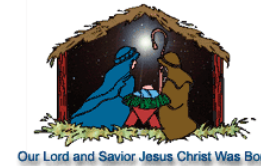
Our Lord and Savior Jesus Christ Was Born